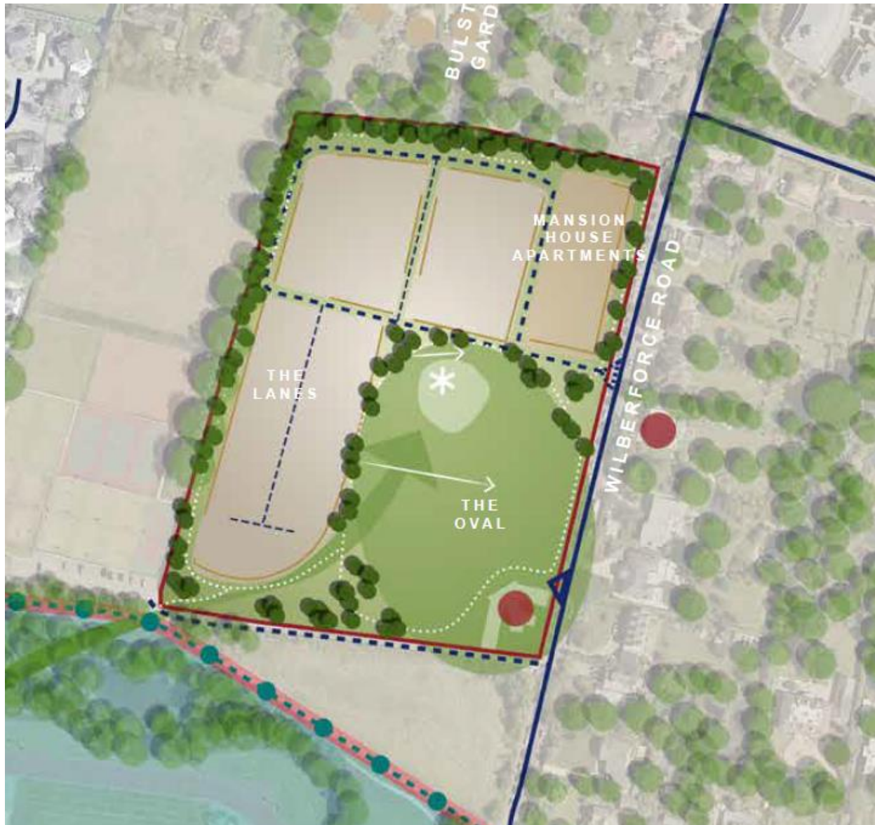
Plan: Concept Masterplan