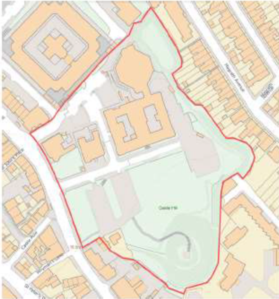
Shire Hall Site Location Plan

If you have any queries in relation to the above or require any further information, please do not hesitate to contact me.