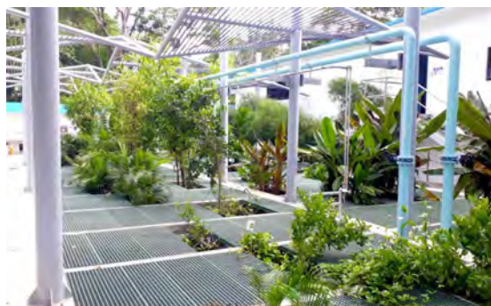
Example of food chain reactor for onsite wastewater treatment and recycling, that is odourless and contributes an indoor garden to light industrial Technopark

100% of potable water consumption is reduced, metered and benchmarked. Wastewater is treated and recycled on site for servicing and industrial processes, and irrigation.