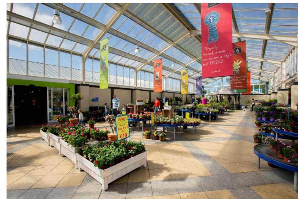
'THE GLASSHOUSE' - Light & Airy, Glass Structure