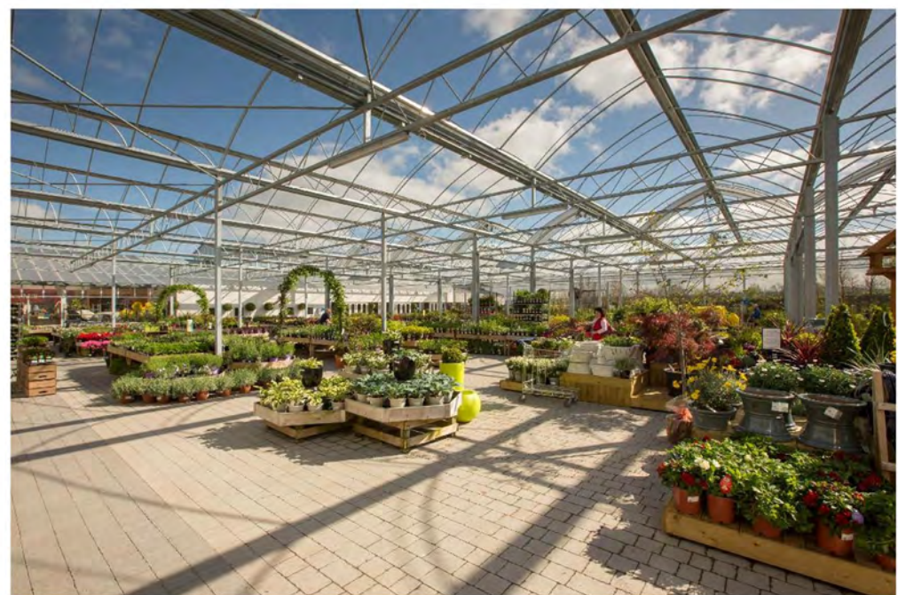
'THE PLANT MARKET' - Rovero Roll-Air Structure