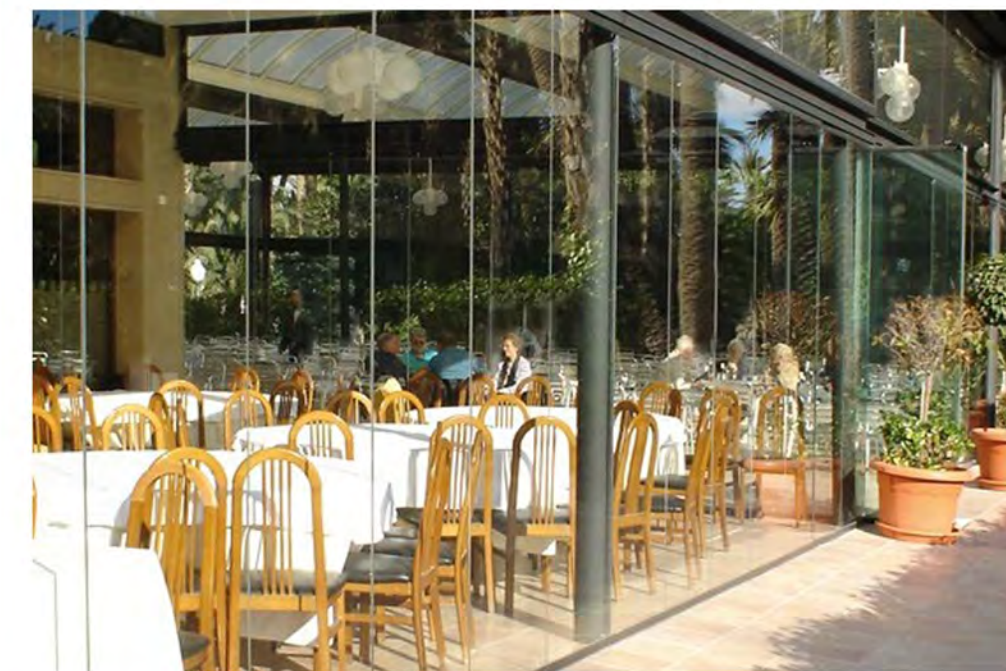
'THE CAFE' - Large Glazing/ Sliding Doors