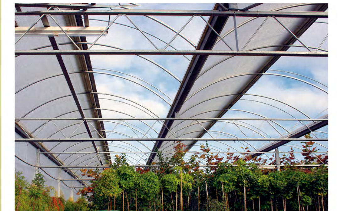
Retractable Roof of the Rovero Roll-Air Structure