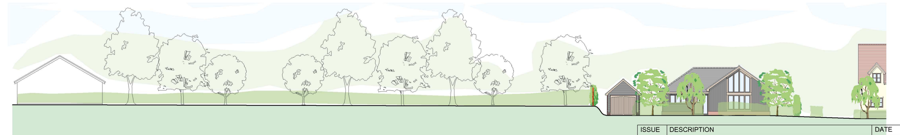
PROPOSED SECTION - BUNGALOW TO MILL END & PLOT 24

Land West of Hardwick Road, Toft, Cambridge, CB23 2RQ