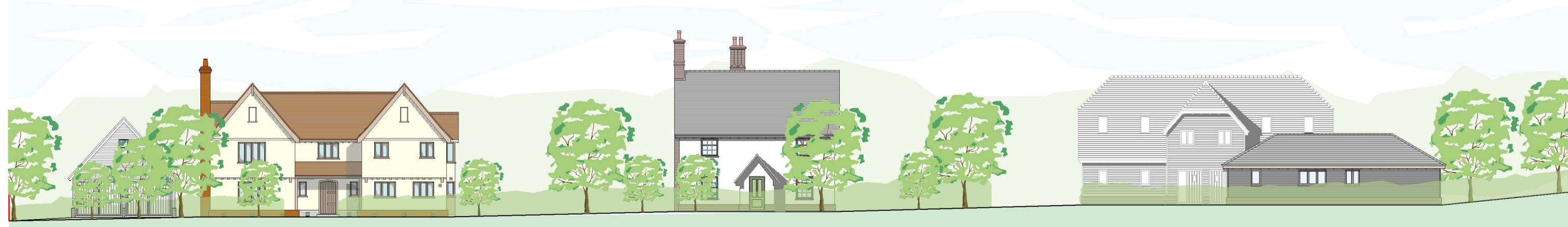
PROPOSED SECTION - NORTH TO SOUTH (From Main Road Looking West)

PROMINENT AREA OF SITE DESIGNED TO REPLICATE TRADITIONAL CAMBRIDGE FARMSTEAD