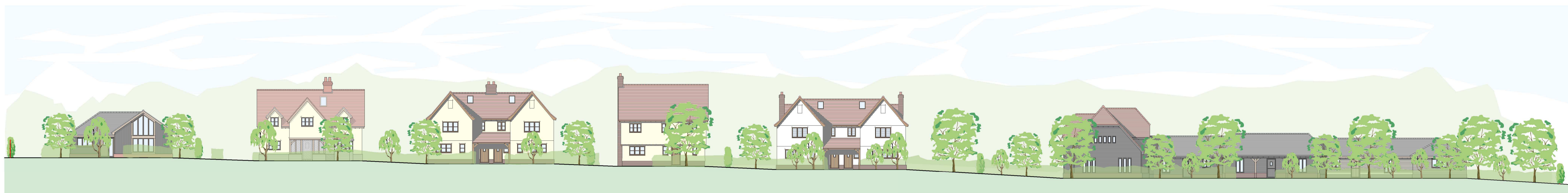
PROPOSED SECTION - EAST - WEST (Through Access Road Looking North)