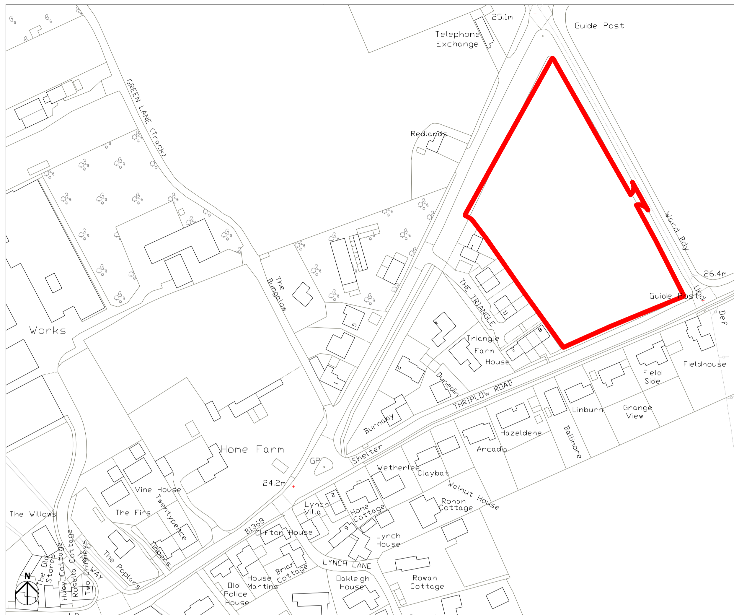
01 EXISTING: LOCATION PLAN - 1:2500