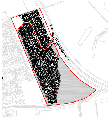
LOCATION PLAN 1:5000@A1

CONSTRUCTION (DESIGN AND MANAGEMENT) REGULATIONS 2015 DESIGNERS HAZARD INFORMATION FOR CONSTRUCTION 1. IF YOU DO NOT FULLY UNDERSTAND THE RISKS INVOLVED DURING THE CONSTRUCTION OF THE ITEMS INDICATED ON THIS DRAWING ASK YOUR MANAGER, HEALTH & SAFETY ADVISOR OR A MEMBER OF THE DESIGN TEAM BEFORE PROCEEDING. THE ABOVE NOTES REFER SPECIFICALLY TO THE INFORMATION SHOWN ON THIS DRAWING. REFER TO THE HEALTH AND SAFETY PLAN FOR FURTHER INFORMATION.