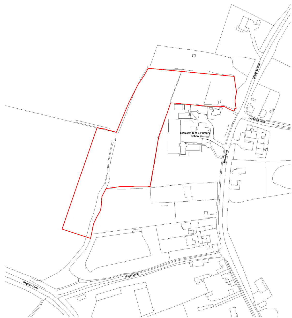
Location plan 1 : 1250