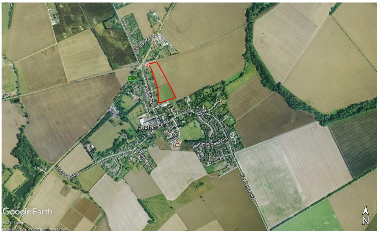
Figure 1: Map showing location of the site.

Foxton has an hourly bus service to Royston, Addenbrookes Hospital, Cambridge and St Ives. During the peak hours of 7:00-9:29 and 16:30-18:59 there are two buses per hour on weekdays.