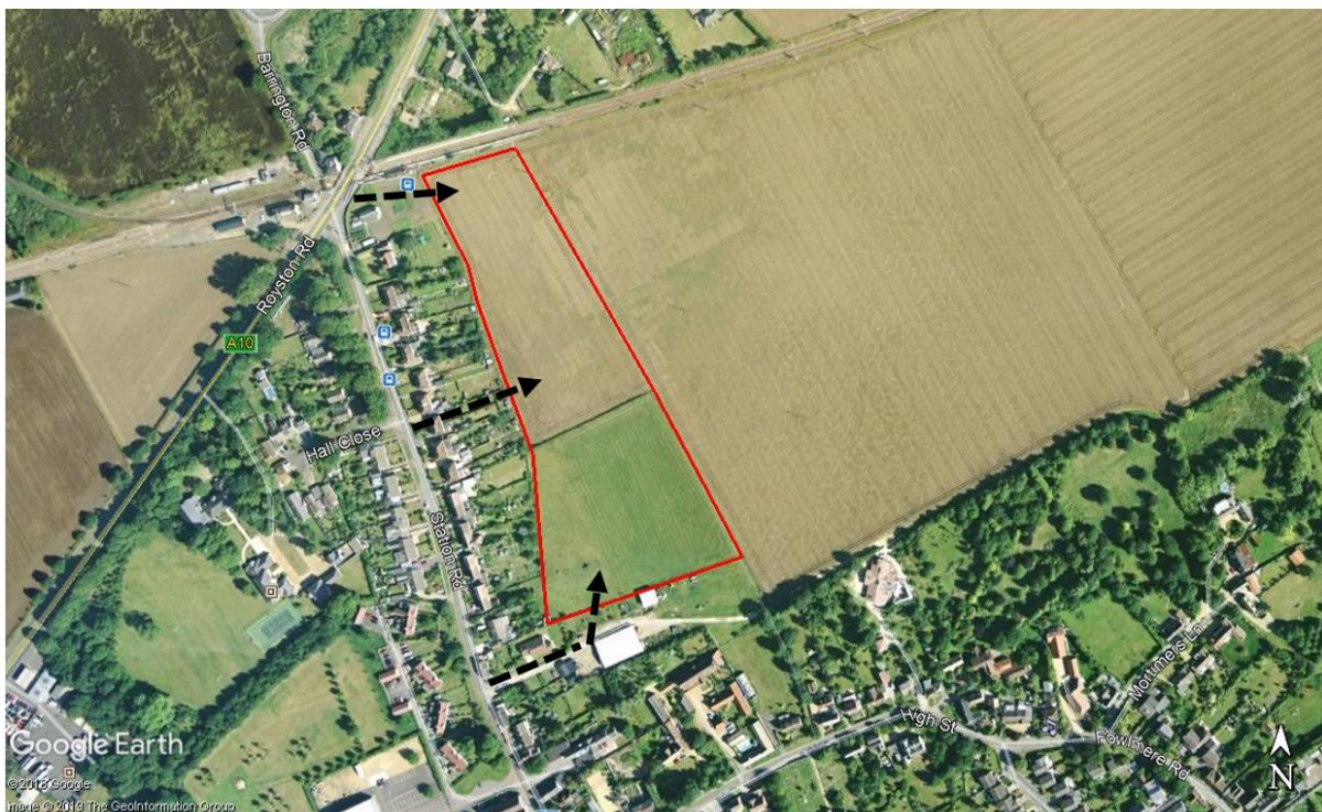
Figure 2: Aerial view showing potential options for access onto the site.

Options are being explored to achieve an access from Station road (figure 2).