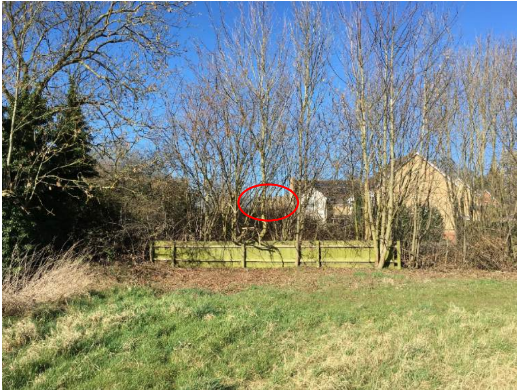
Figure 4: View west from within the site towards 2 Mill Lane, the roof is visible in glimpsed views (red circle) seen in association with intervening vegetation and existing modern development