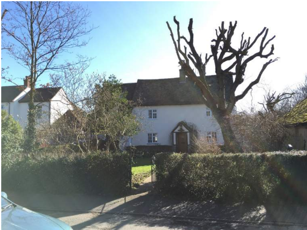
Figure 3: The Grade II Listed 2 Mill Lane, view from the B1049