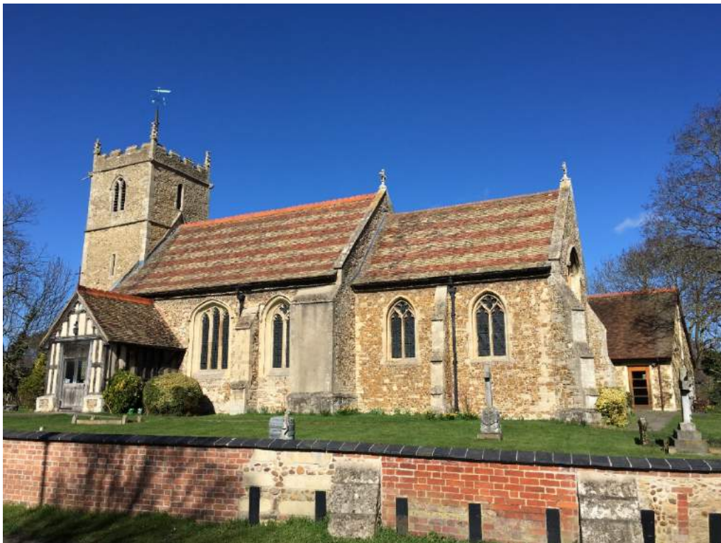
Figure 5: The Grade I Listed Church of St Andrew, view from Burgoynes Road