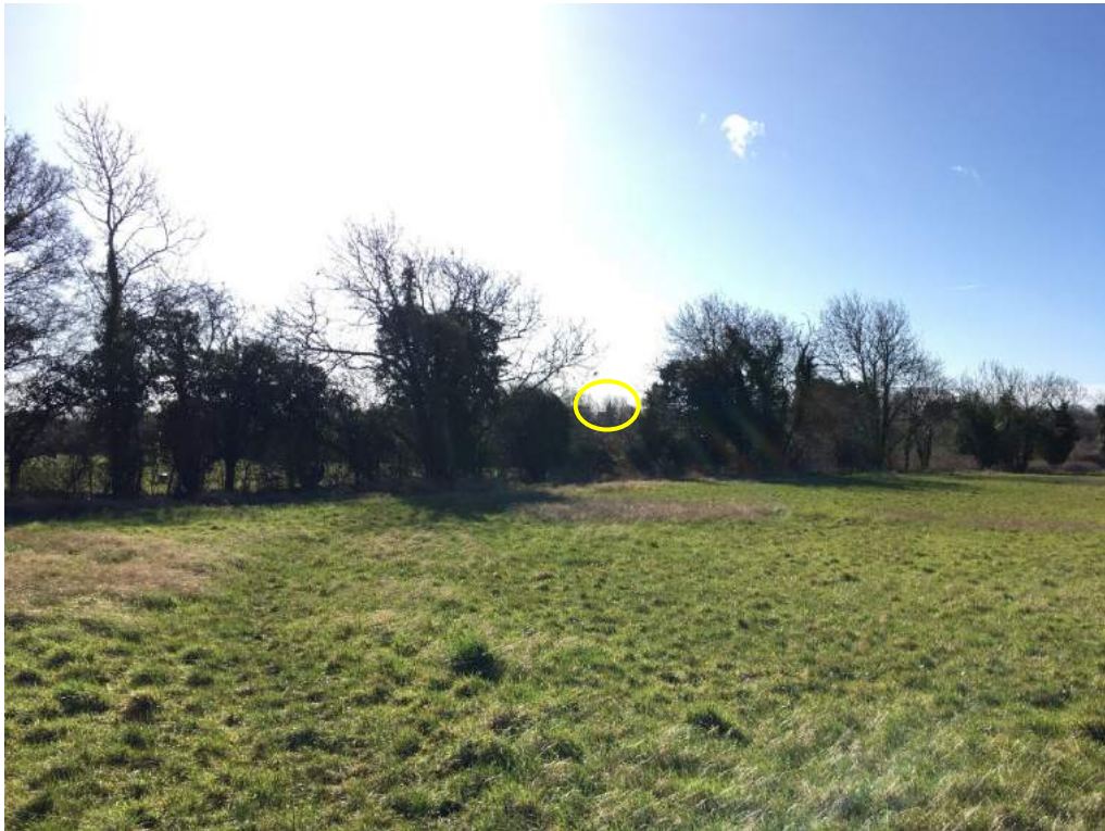
Figure 6: View south-east from within the site towards the church tower (yellow circle)