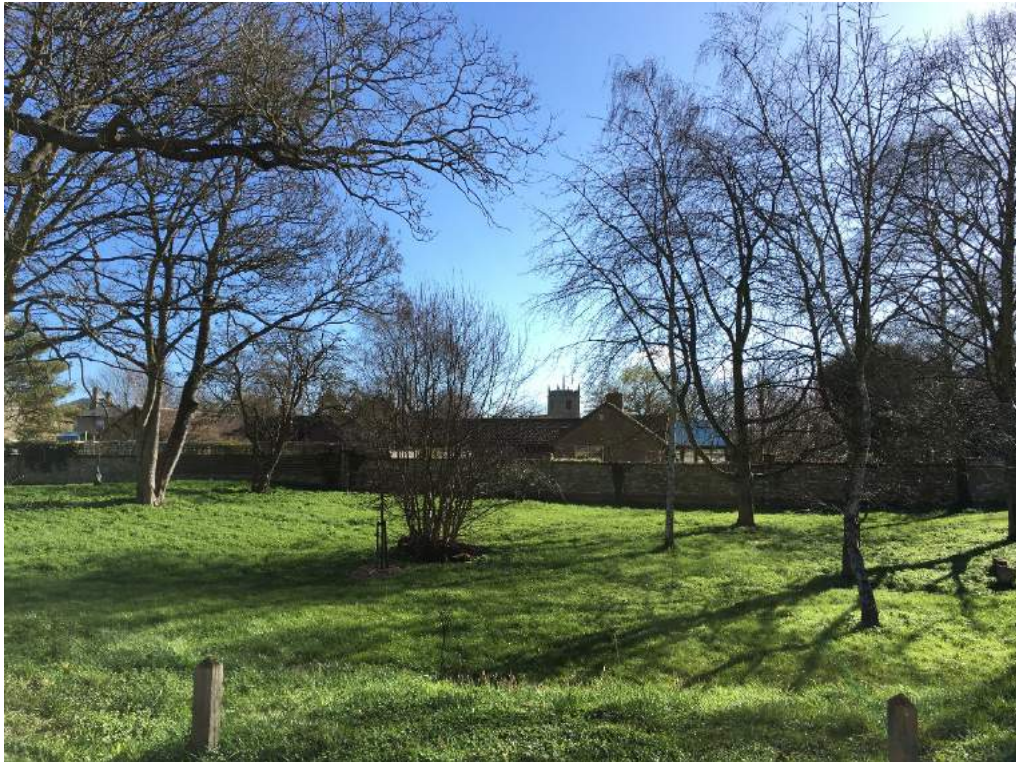
Figure 7: View east from Clay Close Lane to the church tower