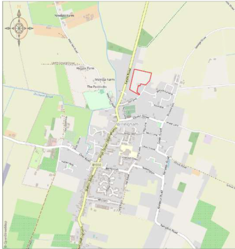
The site in context