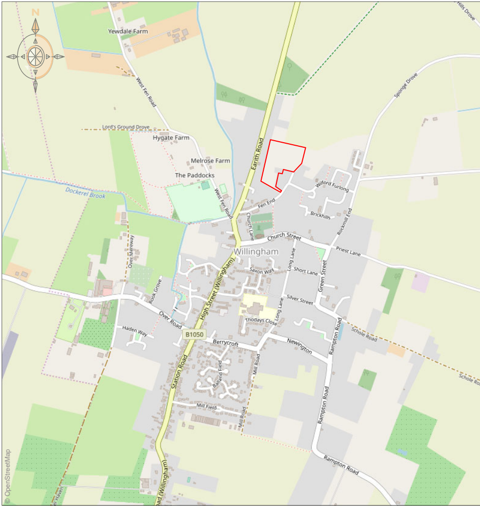
The site in context