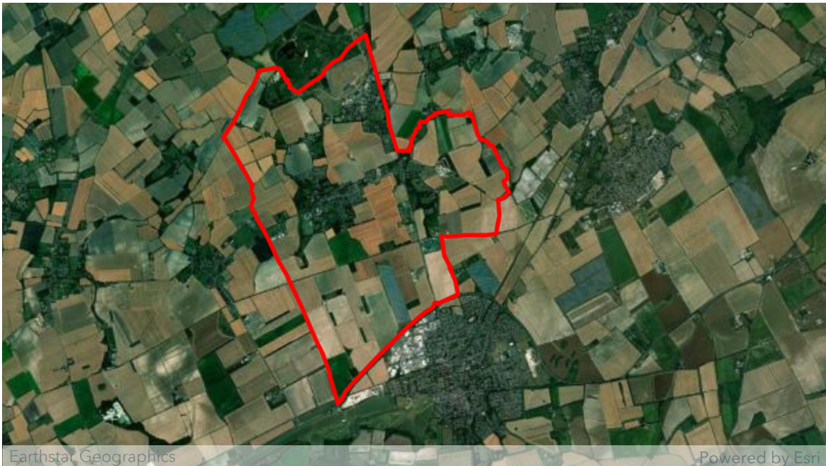
Bassingbourn cum Kneesworth Parish Area map

With a network of public footpaths surrounding Bassingbourn, land at Brook Road presents an opportunity to create a wider link around the network. The map below shows the current network, and the creation of the linkage which would enhance connections to the Green Infrastructure network.