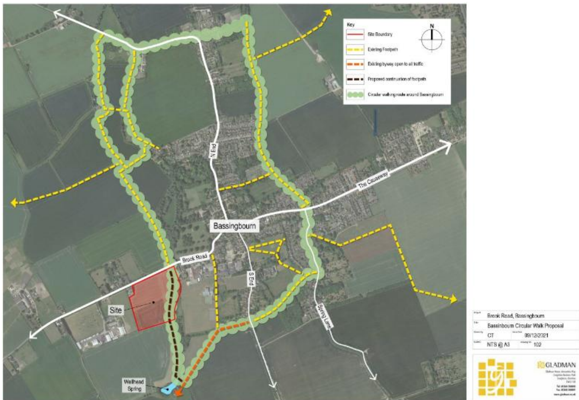
Bassingbourn Circular Walk Proposal

With a network of public footpaths surrounding Bassingbourn, land at Brook Road presents an opportunity to create a wider link around the network. The map below shows the current network, and the creation of the linkage which would enhance connections to the Green Infrastructure network.