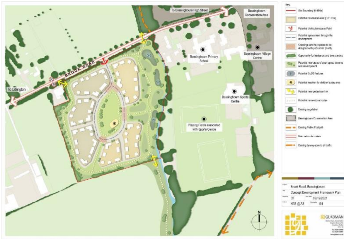
Concept Development Framework Plan for Land at Brook Road, Bassingbourn

A masterplan of how the scheme could be developed is provided below.