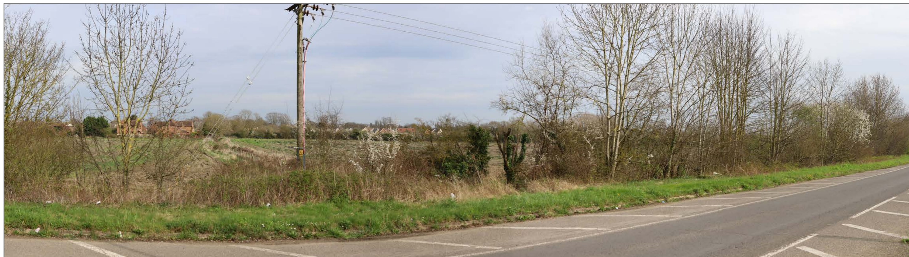
Description: From the A1301 slip road to the west