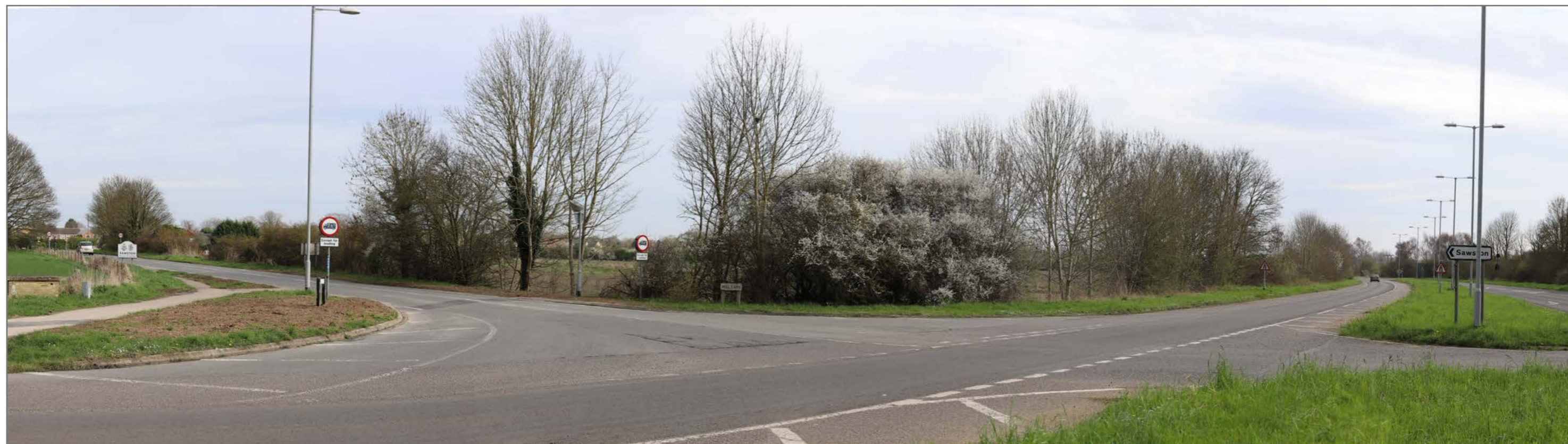
Description: From Mill Lane at junction with the A1301