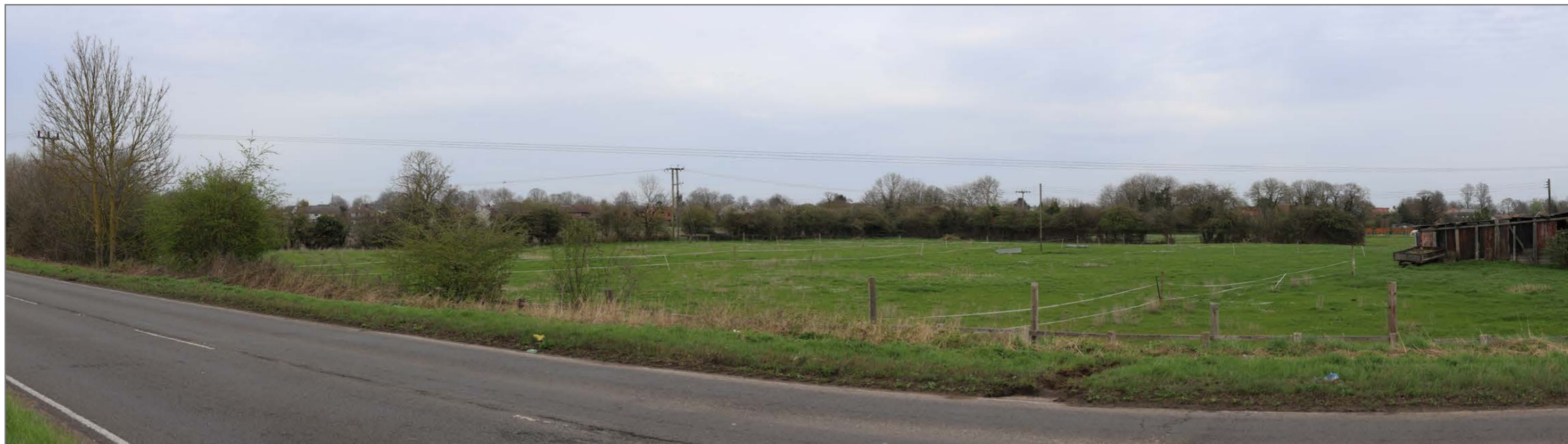
Description: Form the A1301 to the southwest