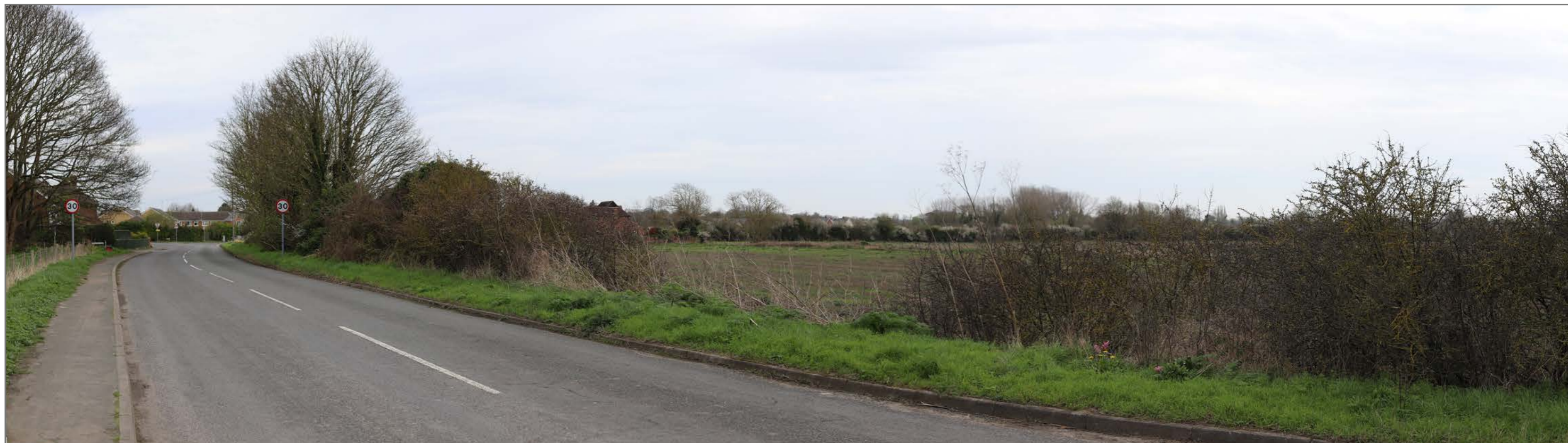
Description: From Mill Lane approaching Sawston