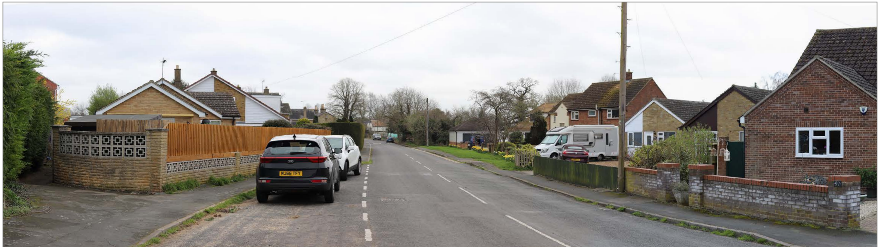
Description: From Mill Lane at the junction with The Stakings