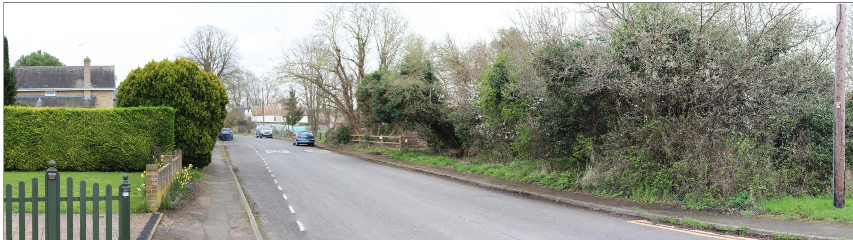
Description: From Mill Lane, west of the site entrance