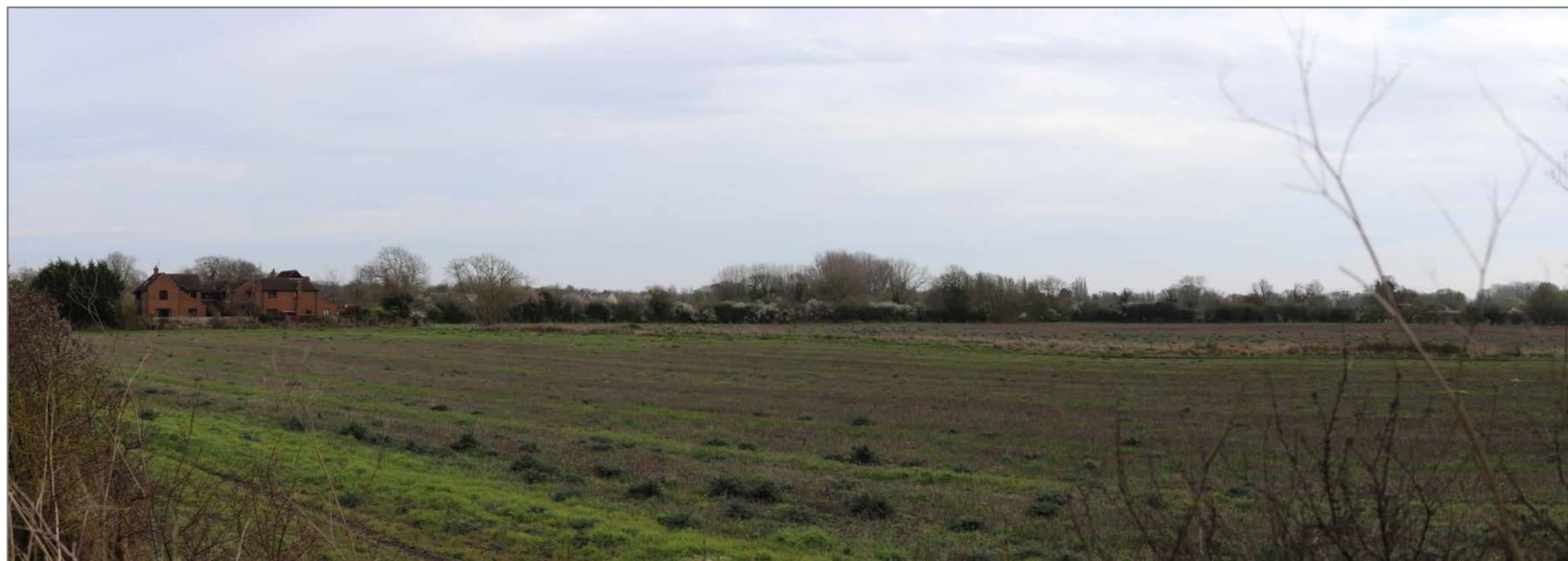
Description: From Mill Lane approaching Sawston