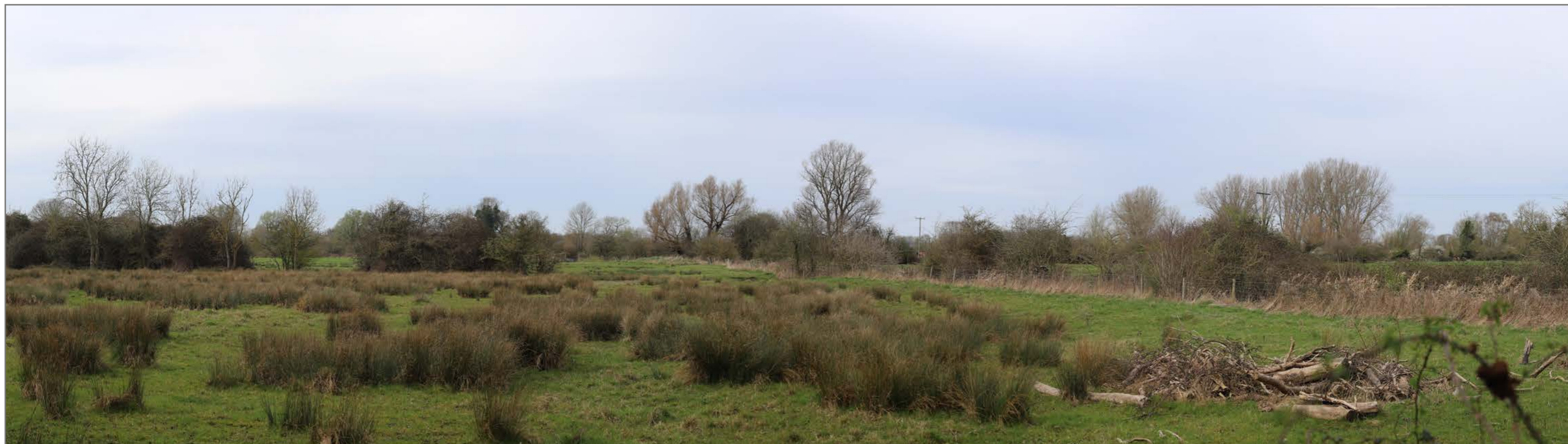
Description: Form Footpath Whittlesford 1, south of the site